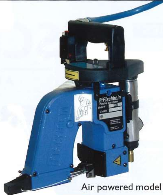
Air powered model

Consumables: thread, tape, needles, lubricating oil