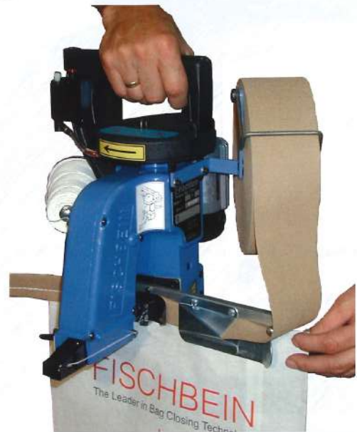
Tape binding attachment for tape sewing